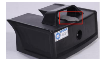
3-pin charger socket