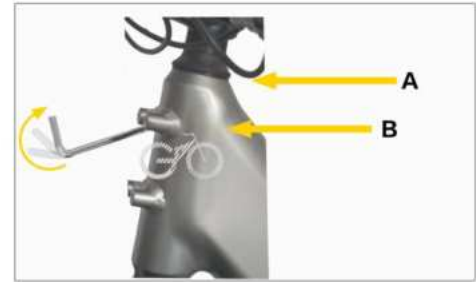
03 Tighten the side A, B screws