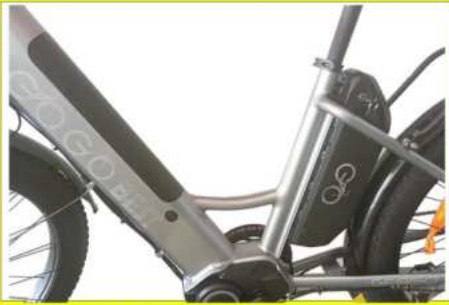
A. Recharge the battery on E-Bike directly