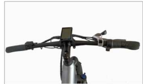
06 Adjust the angle of the brake lever, instrument, and shift lever according to personal riding habits.