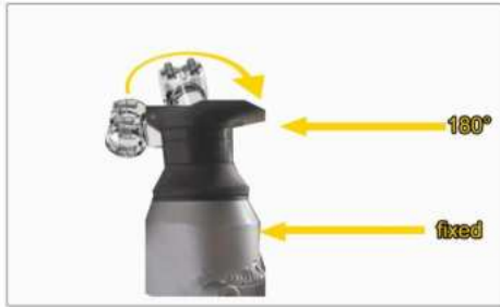
02 Fix the front shock absorber and rotate the riser 180°