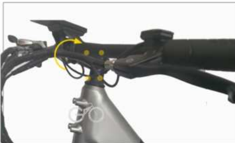
05 Mount handlebar onto stem, then replace stem cover and tighten all 4 bolts.