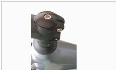
04 Remove front 4 bolts from stem cover, then remove stem cover.