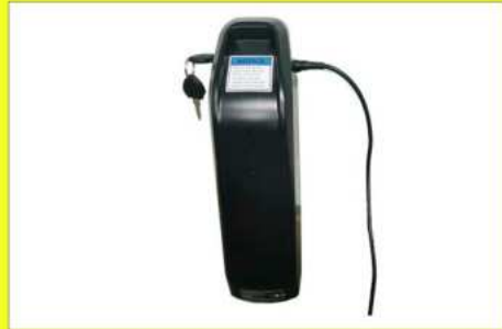
B. Remove battery from the E-Bike and recharge separately